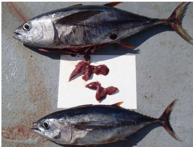
Figure 3. Small size (40-60 cm) yellowfin tuna (up) and bigeye (bottom).